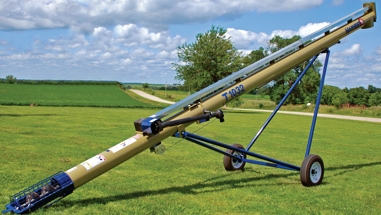
Model T1032 Truck Fill