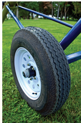
Deluxe rims with new 13" Highway rated tires