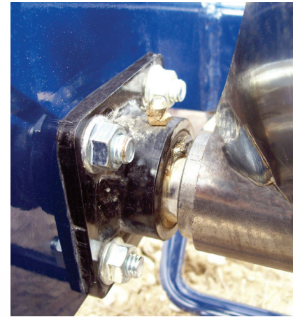
Long service life greasable, lower intake bushing assembly