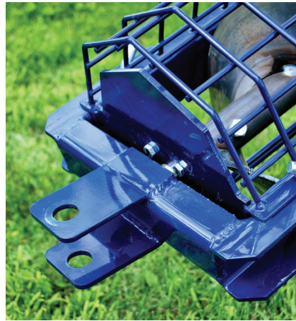
Heavy duty clevis hitch with easy 2-pin removal for hopper attachment