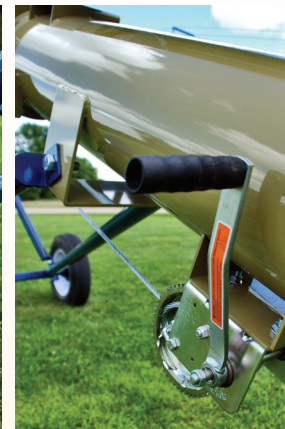
High-quality brake winch lowers and raises the auger