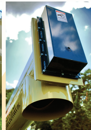
Top drive chain cover and lubrication housing features double-tapered bearings