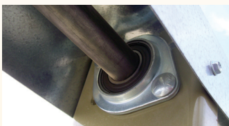
Sealed drive shaft bearings