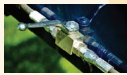
Anti Settling Shut-off Valve