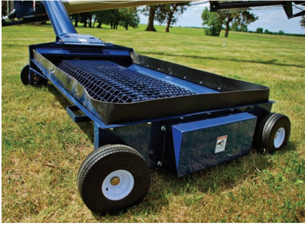
Low Profile Hopper 66" x 41" x 11.5" with Flat Free Tires

All 'H' Series are Hydraulic Scissor Lift