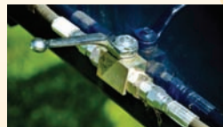
Anti Settling Shut-off Valve

Top auger to bin anchor allows user to secure auger in position.