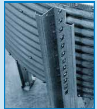
Bin legs are formed from all-galvanized steel for superior fit, durability, and strength.