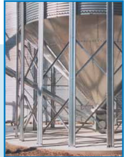
Sturdy "X" bracing between legs gives additional bin strength. Bracing is simple to assemble and offers access to boot.