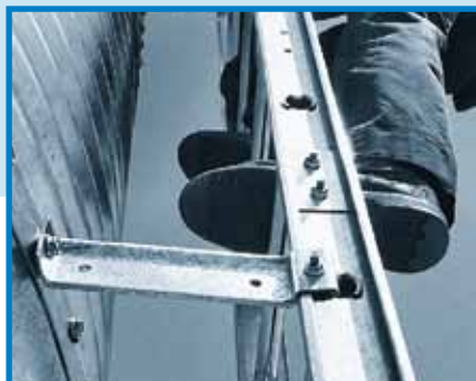
Side ladders allow plenty of space between rungs and bin wall for a secure footing.